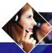
EMTEL® 全球应急电话服务 24h Global Emergency Telephone Service