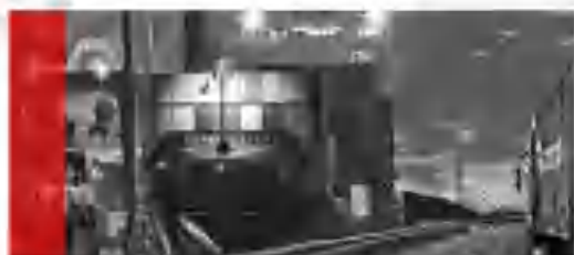
危险货物安全顾问服务 DANGEROUS GOODS SERVICE

The GBK GmbH Global Regulatory Compliance was founded in 1986 and has now become an international consulting company in Germany and Switzerland in the areas of Environment, health and Safety. The team of GBK experts support more than 1000 satisfied customer worldwide regarding issues related to handling of dangerous goods and specialized services for regulatory, environmental, health and safety matters.