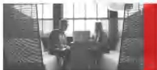
企业危险品供应链合规审核 EHS AUDITING, RISK ANALYSIS & CERTIFICATION WITH CFP